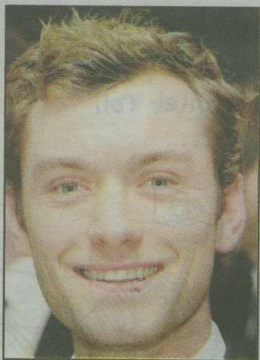
■ FAVOURITE ... Jude Law