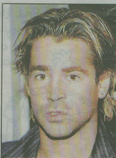
■ OUTSIDER ... Colin Farrell