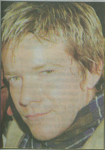
■ MANCUNIAN ... Max Beesley